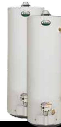
Two Conventional Gas Models Under 55 Gallons

Installing two smaller standard gas units will not be as energy efficient as a high efficiency Voltex or tankless for homeowners, but it may be an option in some cases.