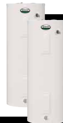
Two Conventional Electric Models Under 55 Gallons

Installing two smaller standard electric units will not be as energy efficient as a Hybrid Electric for homeowners, but it may be an option in some cases.