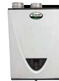
High Efficiency Gas Tankless Models

A. O. Smith offers a full line of high efficiency gas tankless units that are ideal for delivering large amounts of hot water while saving space.